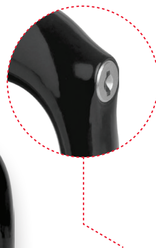
M46 1P12 C/C