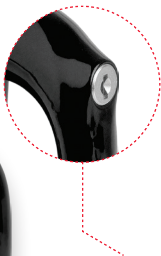
M41 U C/C/31 (JALOUSIE)*